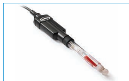
Recognises INTELLICAL probes for routine and challenging samples