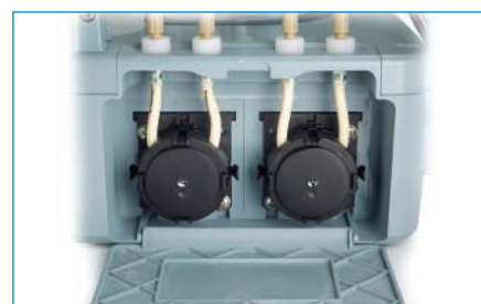
1 external and 2 embedded peristaltic pumps